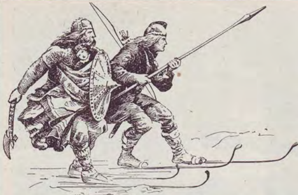
Birkebeiners with the King's son Haakon in the year 1206 (from a painting by Bergslien)