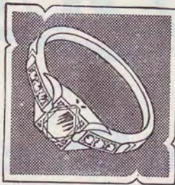
Solitaire, 18-kt. white gold, three diamonds on each shoulder $100.00.

Q UALITY for quality, we are confident Birks diamond prices represent the best values obtainable — regardless of how large or small a stone may be under consideration.