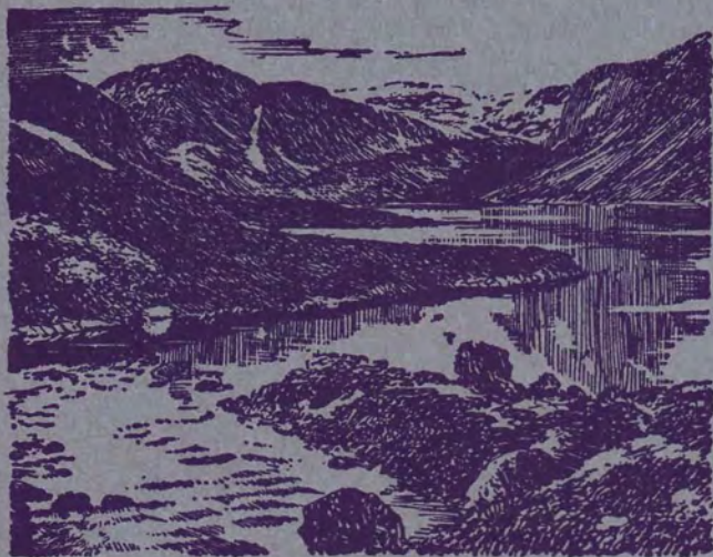
A typical Scottish Loch

Whisky actually distilled in Scotland has a flavour and a fragrance that other whiskies cannot hope to equal! You want real Scotch whisky at its best.