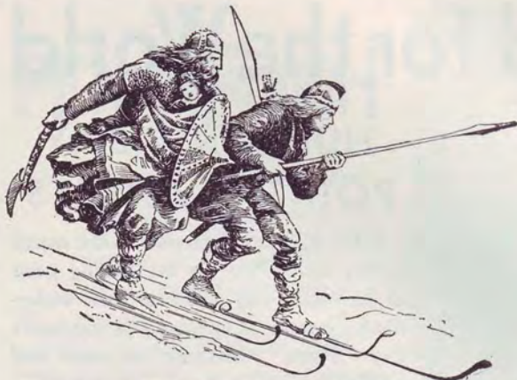
Birkebeiners with the King's son Haakon in the year 1206 (from a painting by Bergslien)