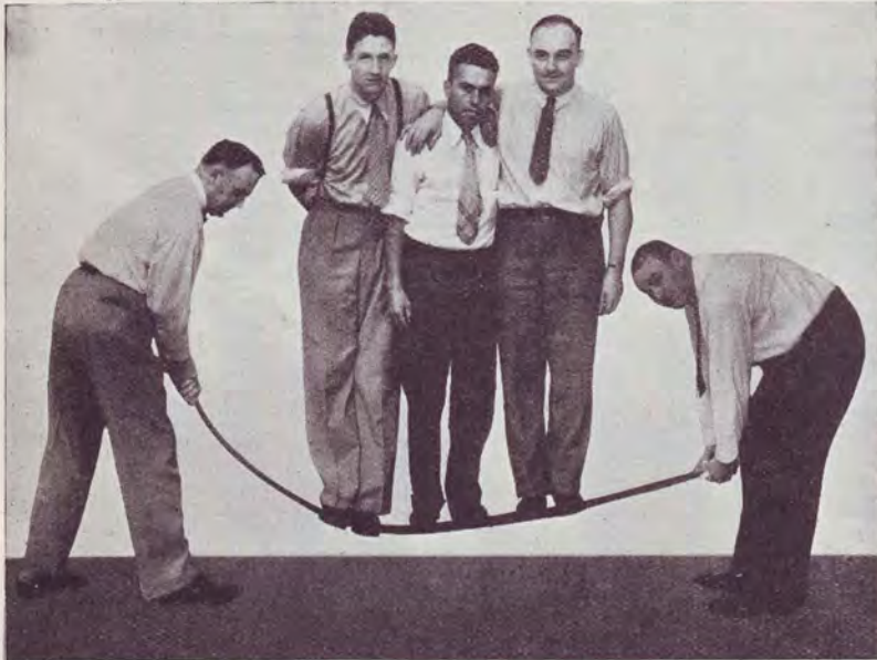
Lifting five hundred (500 lbs.) pounds on a Kandahar two inch (2") racing ski

"CANADA SKIS" are made in the largest and best-equipped ski plan in the British Empire.