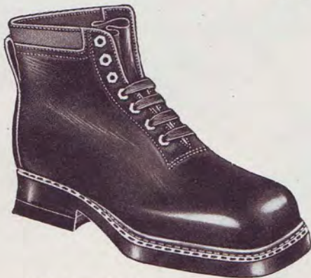
The "GARMISH" Even finer than last year's record-breaking line which dominated the field.