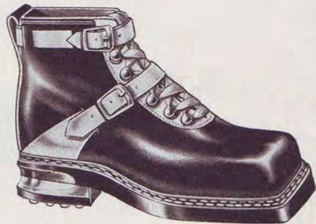
The "HANNES SCHNEIDER" not just another Ski Boot but the real sensation of this season . . . The boot that will take Premier Honors on every hill and trail.

ON SALE AT ALL LEADING SPORT GOODS SHOPS