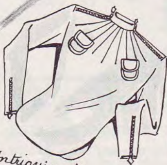
Intriguing flannel shirt