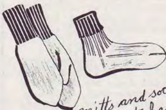
matching mitts and socks of Goat hair