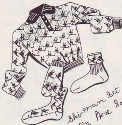
Ski-man Set Sweater Hose Socks