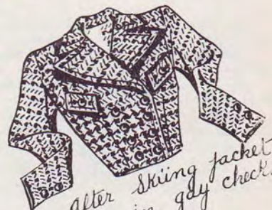
after Skiing jacket in grey checks