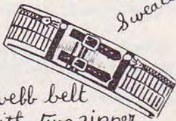
Web belt with two zipper pockets