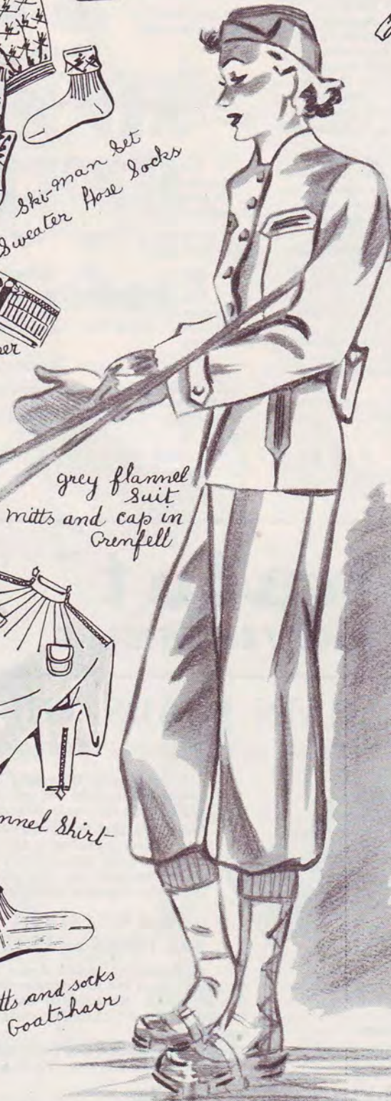
grey flannel suit mitts and cap in Grenfell